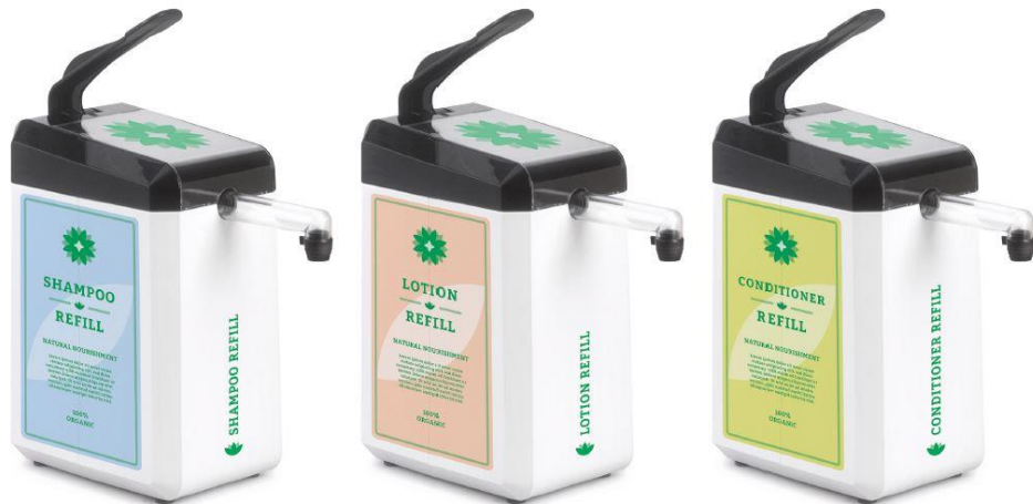
Examples of refill dispensers